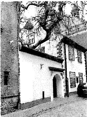
This is Luther Academy in the Fall