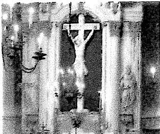
This is St. John Lutheran Church where we have English services every Sunday starting in October.

At a more "nuts and bolts" level, we had our intensive summer classes in June before our students went back to their home churches for summer vicarage. Our program is mostly on-line with two in-person intensive weeks per year. So, virtually all our students are connected to a Lutheran church where they live. This is where they are mentored by a supervising pastor as they make their way through our program. Unlike the United States, we cannot have these students do a full, one year vicarage. Instead, we have them do three summer vicarages, and each year they grow in their participation and responsibilities. Besides teaching the systematics courses, I am currently also the director of vicarage, so I get the privilege of meeting with students and vicarage supervisor. I see how things are going and what we can do to help or be in service in making vicarages as effective as possible. Also, like our seminaries in the US, we at Luther Academy do not ordain men into the pastoral office. This is done by their church bodies of whom they are members. We just certify them as candidates who have been adequately trained for pastoral office.